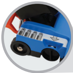
Four position height adjustment