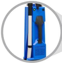
On board vacuum wand