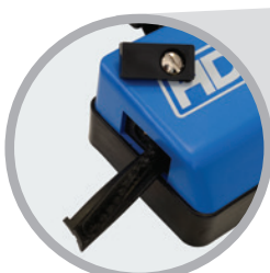
Quick change brush strip