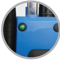
Illuminated on/off switch