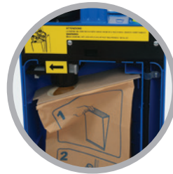
Top fill bag