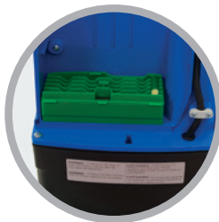
Optional HEPA filter available