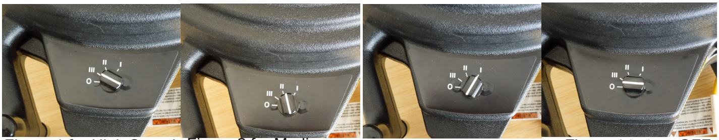
Figure 1 for High Speed Figure 2 for Medium Speed

The Speed selector switch provides the following settings, III = High Speed, Figure 1; II = Medium Speed, Figure 2; I = Lo, Figure 3; and 0 = Off, Figure 4.