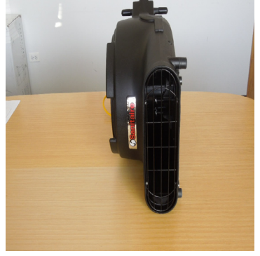
Figure 5 Horizontal