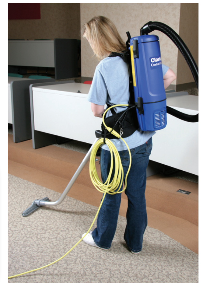
The exhaust air is directed away from the operator and upward. Keeps you cool during operation.

In an independent test study by the Swedish-based Tva Ergonomer Testing and Ergonomic Consultancy Bureau, the Comfort Pak vacuums were compared to three other leading brands of backpack vacuum cleaners. In its report, the bureau concluded that the Comfort Pak rated "better than rival backpack vacuums on all design criteria" . The ergonomic evaluation further noted the importance of the Comfort Pak's light weight and overall harness design in minimizing stress and strain on the body.