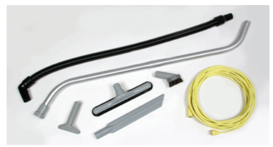
The standard tool kit fits all your cleaning needs. Ideal for carpet and hard floor areas. The belt has convenient tool storage.