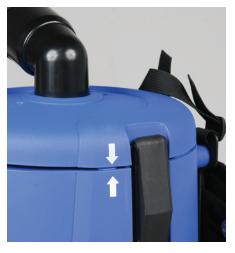
Arrows assist operator with securing canister lid and latches in the correct position. Easy to snap latches allow access to the canister and paper bag.

Multi-use Operation: On-board tool storage for quick and easy tool change. The complete tool kit is ideal for carpet and hard floors, overhead, and detail cleaning operations.